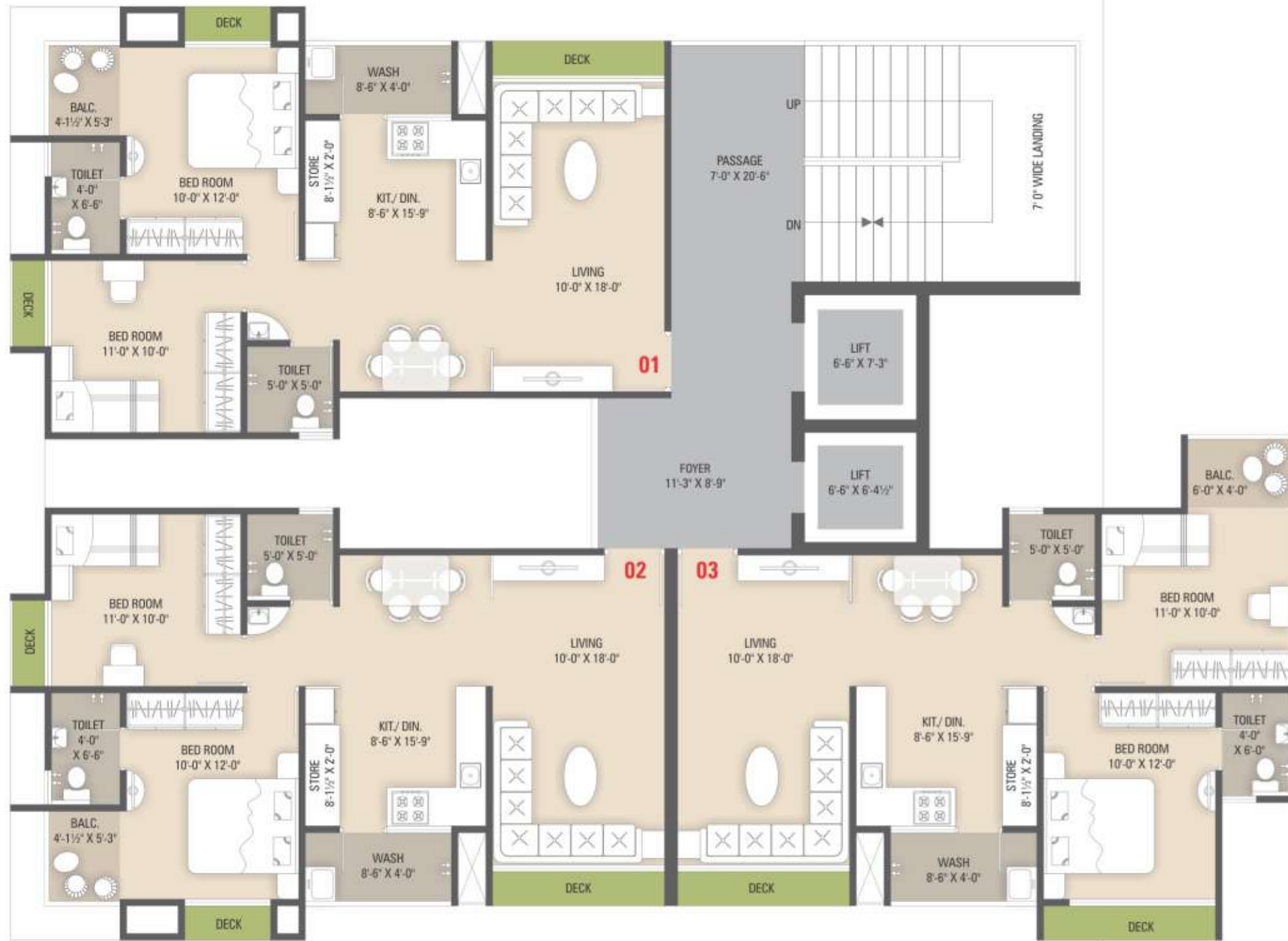
FLAT NO.: 01 & 02 RERA C.A. - 664.00 SQ.FT. | WASH & BALCONY - 61.00 SQ.FT.