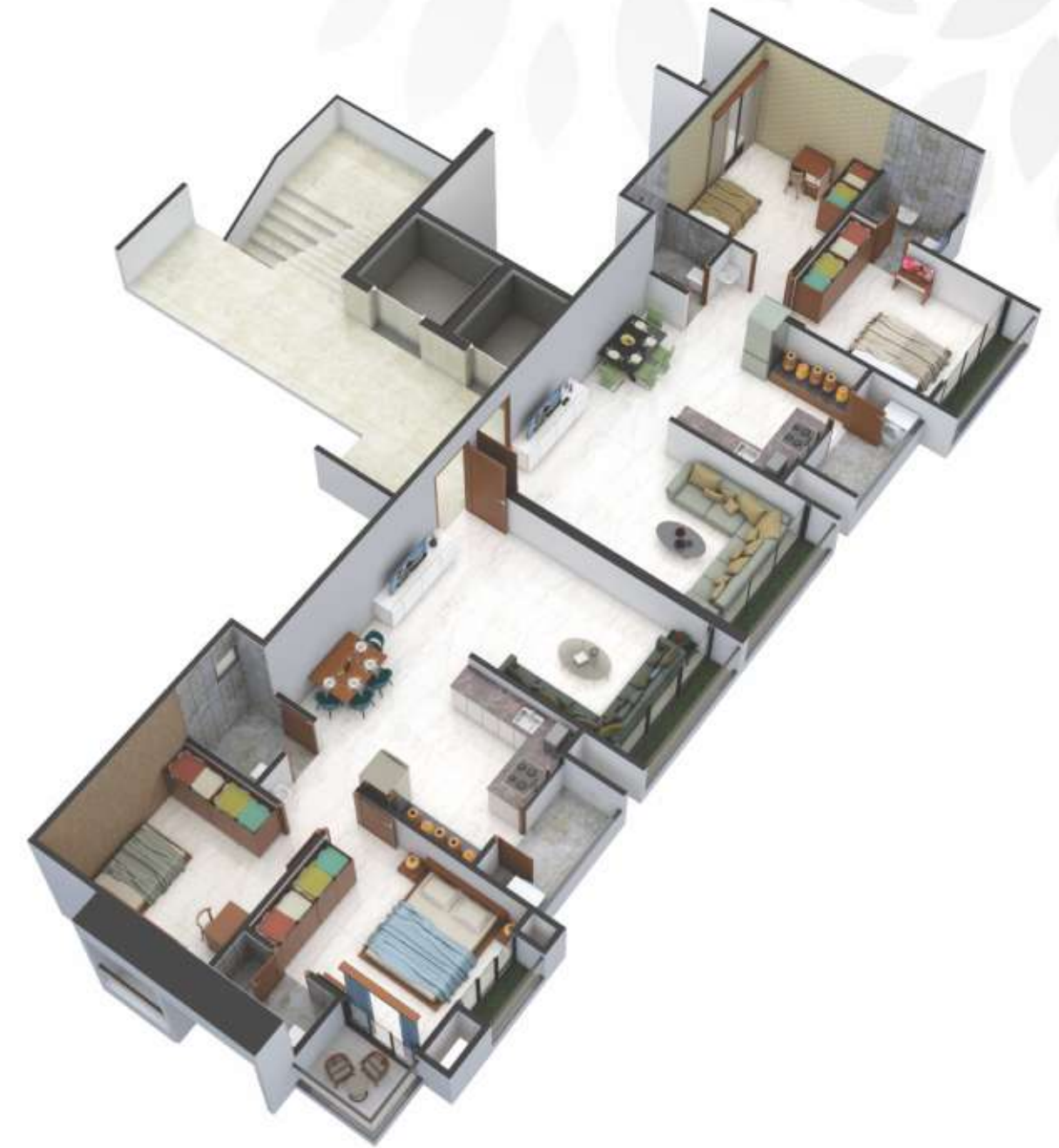
B | TYPE UNIT VIEW