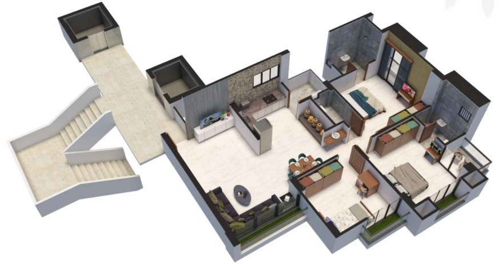
A | TYPE UNIT VIEW