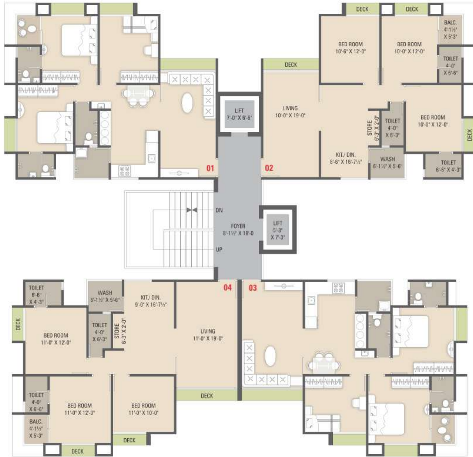
FLAT NO.: 01 & 02 RERA C.A. - 858.00 SQ.FT. | WASH & BALCONY - 60.00 SQ.FT.